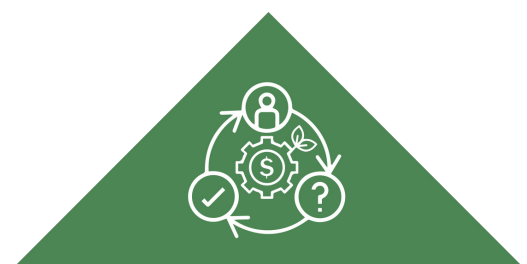
Image credits: BUILD2050 logo, source: https://build2050.weebly.com/circular-economy.html

Next, some economic issues according to the LCA will be presented. In the end stage of the course there will be also a challenge for all participants.